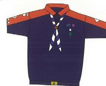
The Joey Scout Uniform