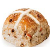
(Apple and Cinnamon)