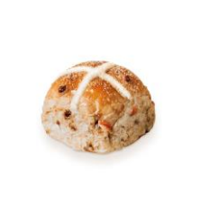
(Apple and Cinnamon)