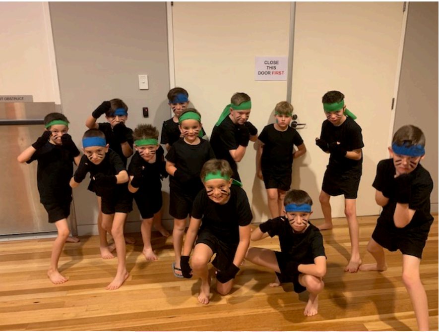
Crazy Hair Day