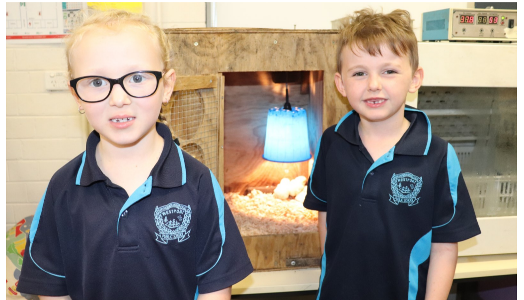
Paperbark participating in some hands on learning