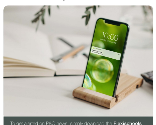
To get alerted on P&C news, simply download the Flexischools App and log in or register to create an account.

Your P&C are now using Flexischools to communicate important news and event information with you.